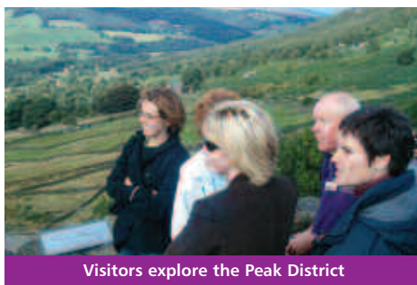
Visitors explore the Peak District