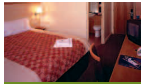
Research assists hoteliers and DMPs

The project is now being extended to encompass self-catering properties in the Peak District and EMT is intending to roll the scheme out to the region's other destinations over the coming months.