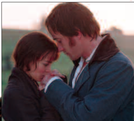
Region promoted on the international arena