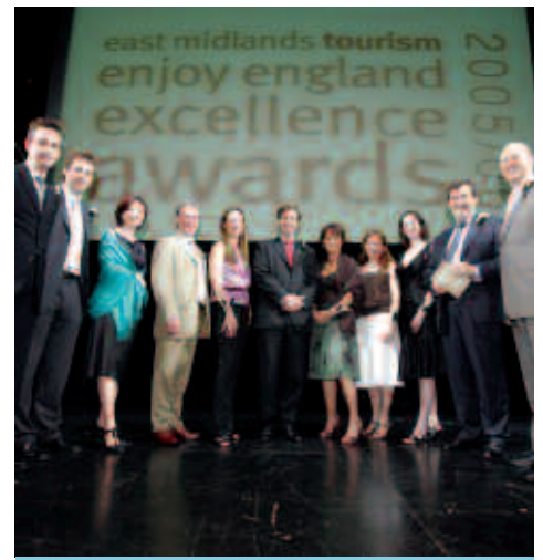
The EMT team